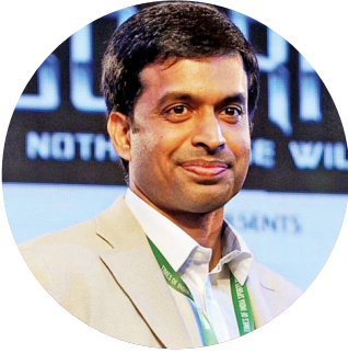
Padma Bhushan Pullela Gopichand Indian badminton player Dronacharya Award for Badminton 2009