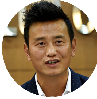
Padmashri Bhaichung Bhutia Indian Footballer and Coach